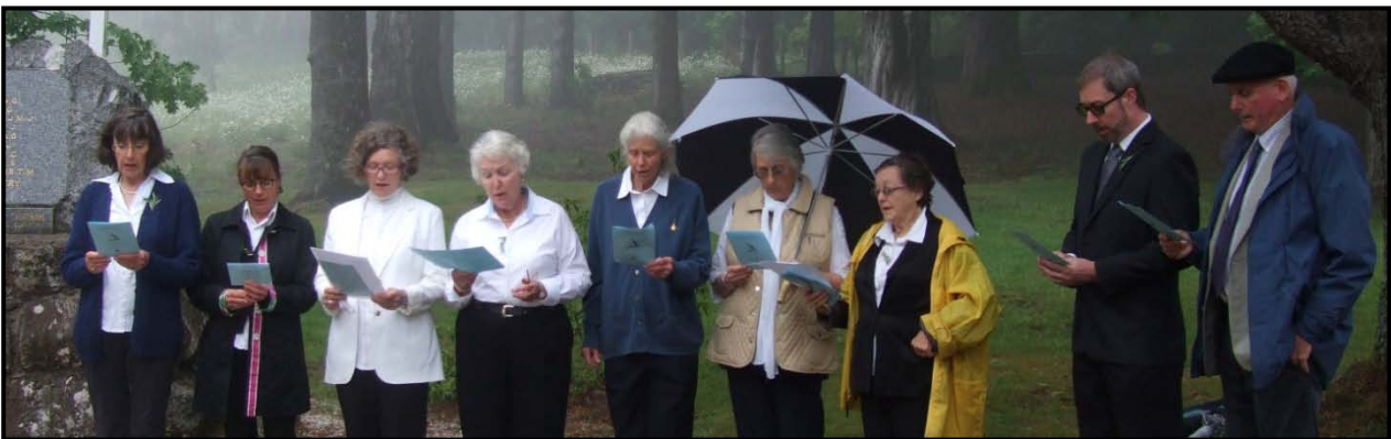
The Mt Wilson choir performing at the 2014 Remembrance Day service

As is the custom, I have chosen two names from the War Memorial, both from our group of first settlers 5 and both fought in WWI.