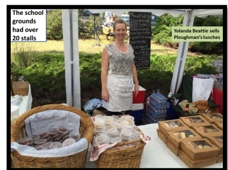
The school grounds had over 20 stalls