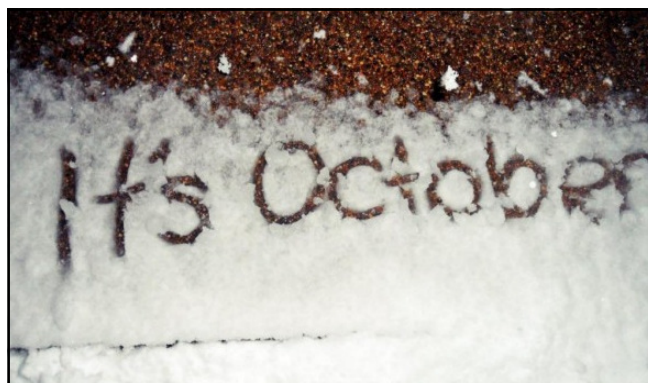
It's October in Lithgow!