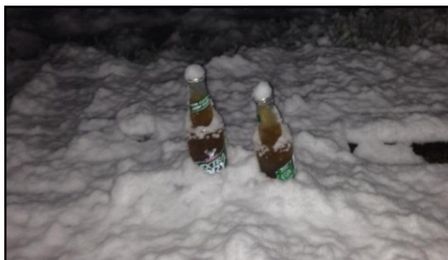
But at least the beer was cold in Hartley