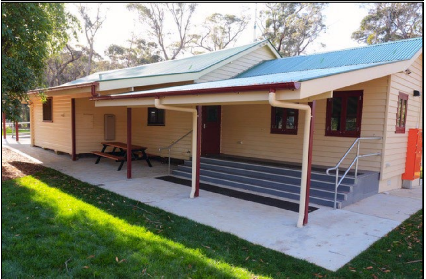
Above: the old and new entrances.