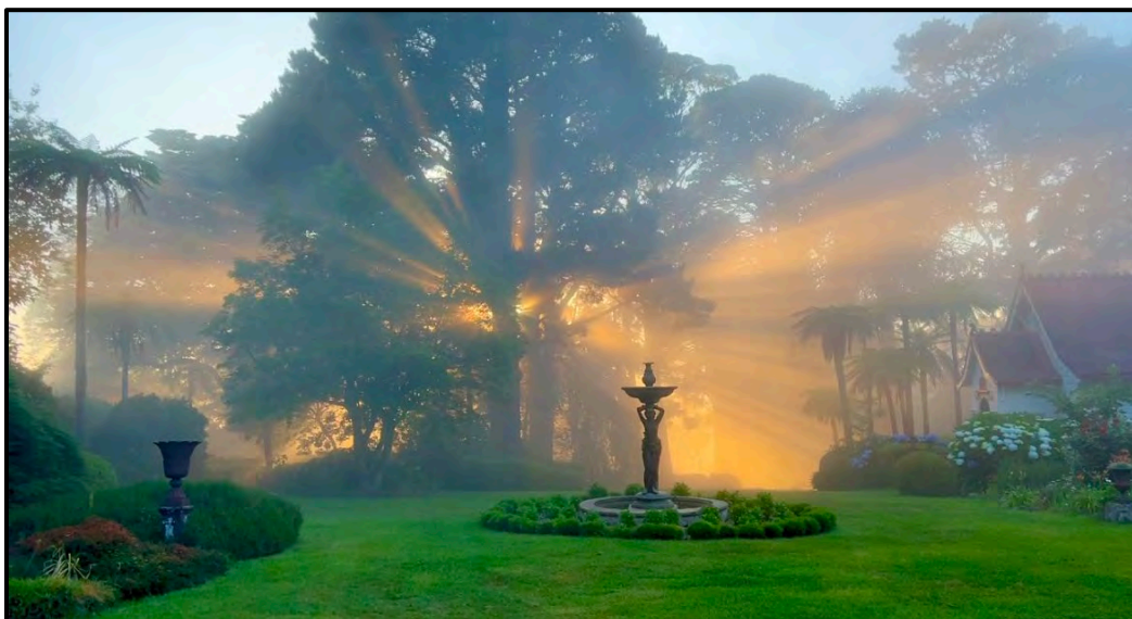
Christmas Eve Sunrise at Sefton Hall.