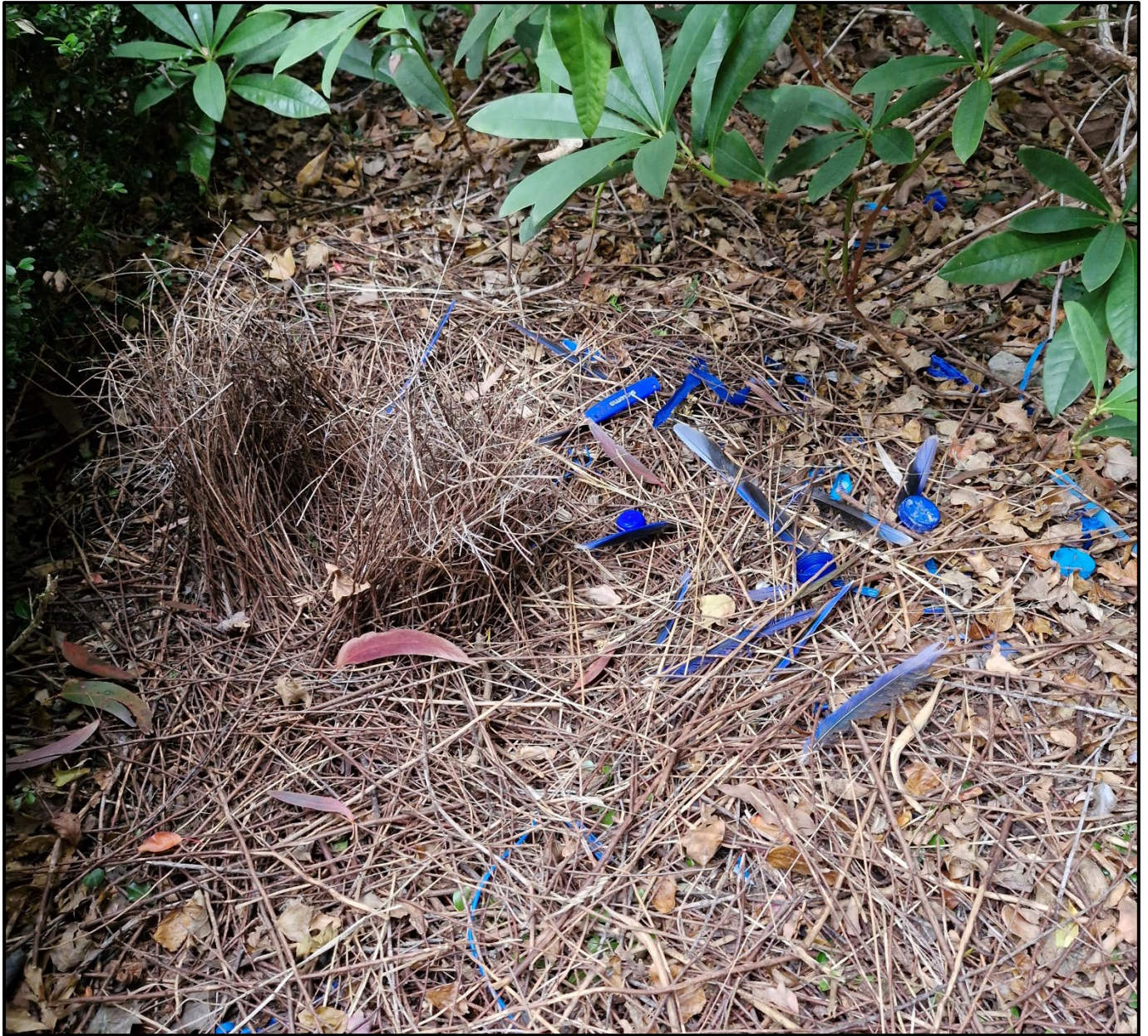
Urban sprawl at Mt Wilson. Another bower bird nest under construction, no permission sought