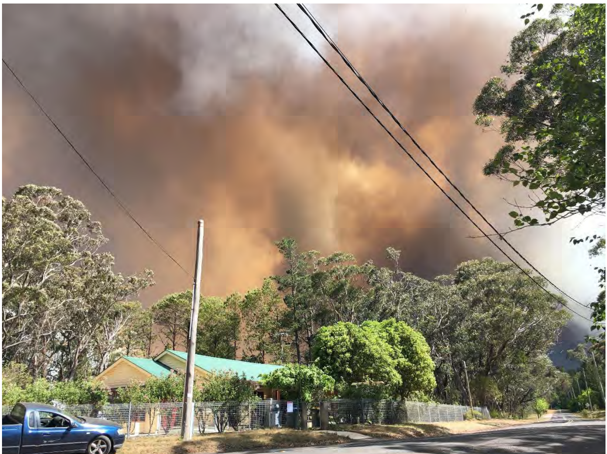
View from the Fire Station at 4pm looking towards the Hall, Sarah Howell