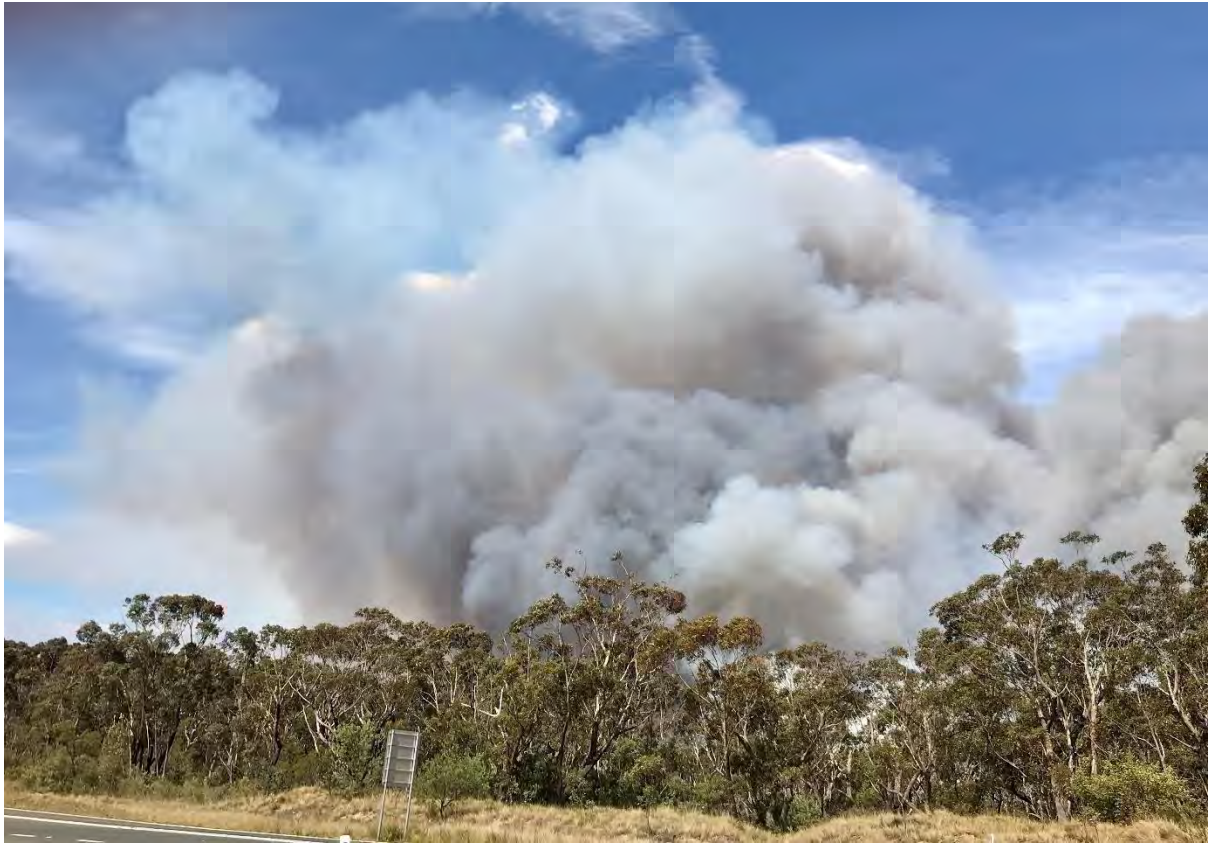
From Bells Line of Road at 3.40pm, Alex Halliday