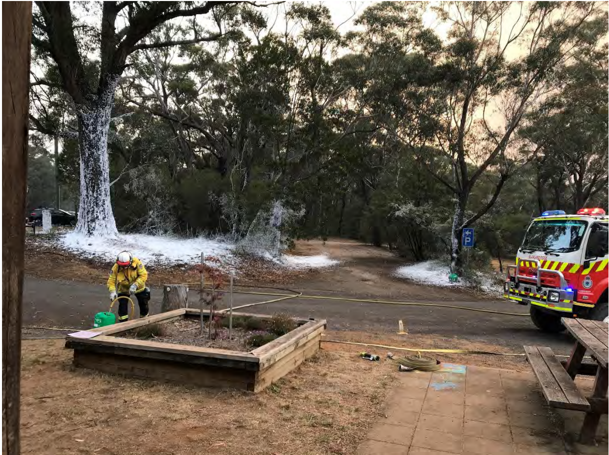
Surrounding fire station with foam as fire approached, 5.30pm, Ted Griffin