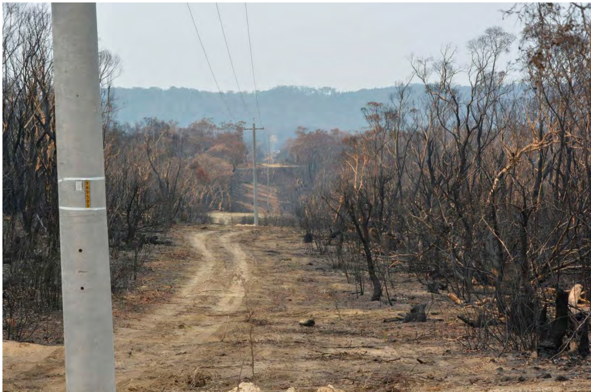
Power restored - new pole with wires up, Steve Woolfenden

Beth Raines, Community Email, 21 December