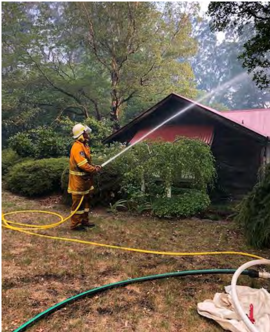
Chimney Cottage, Rosie Walsh