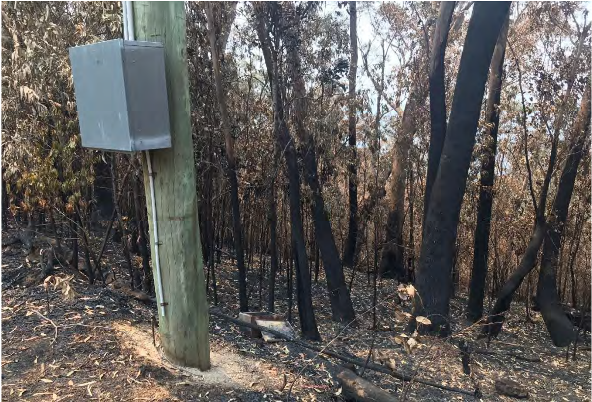
New pole and box, old box abandoned on the ground, Alex Halliday