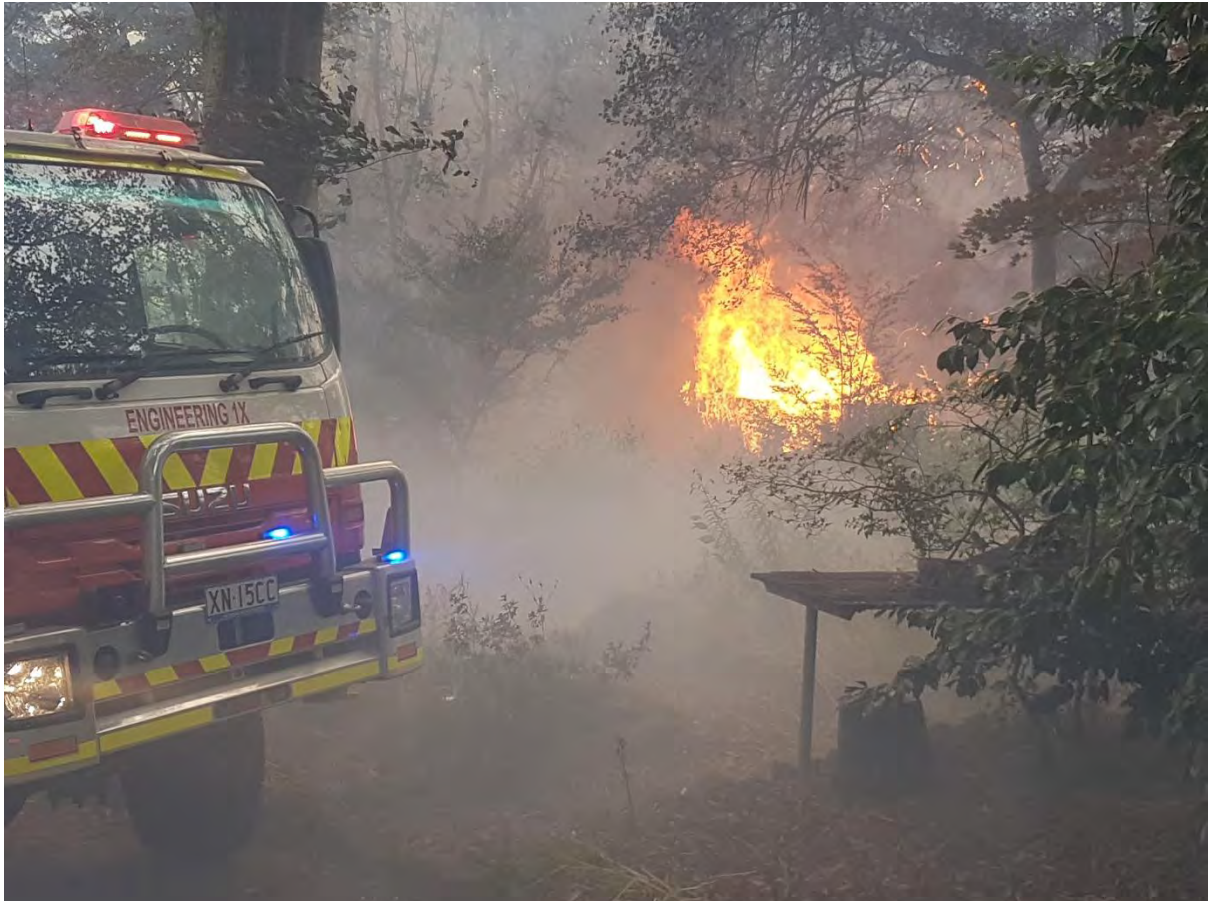
Wynnes Rocks Road (above) and Coppins (below), both Peter Raines