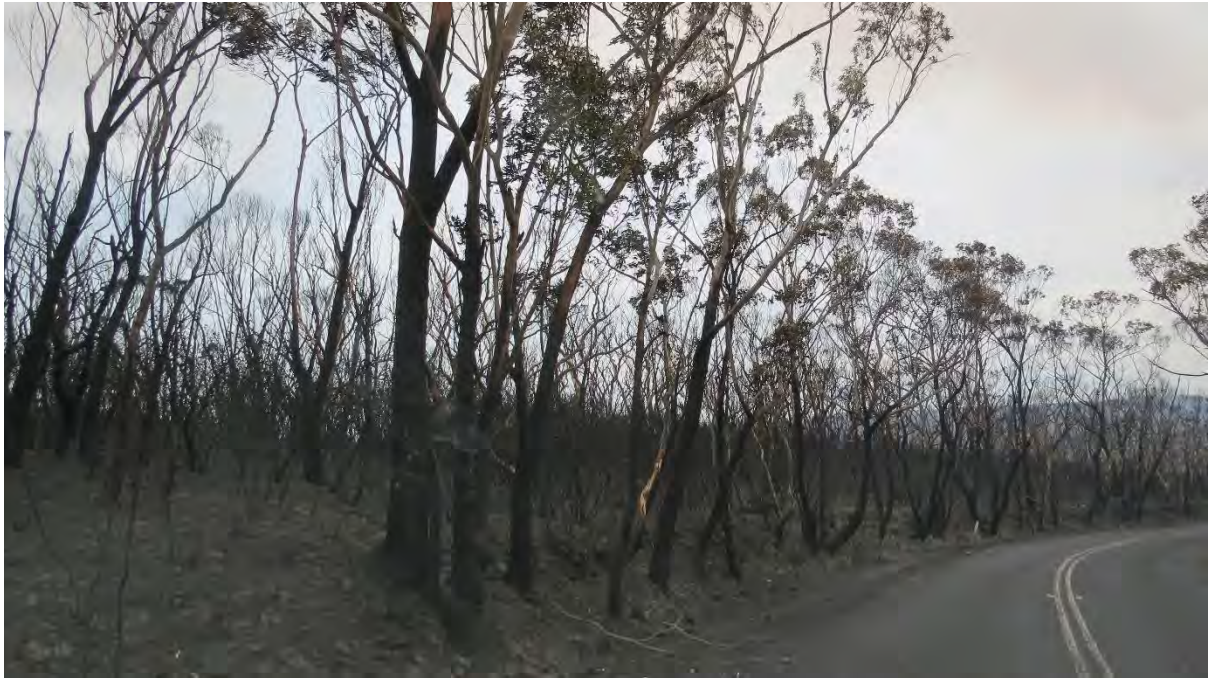
On the Five Mile, Alex Halliday (above and following four images)