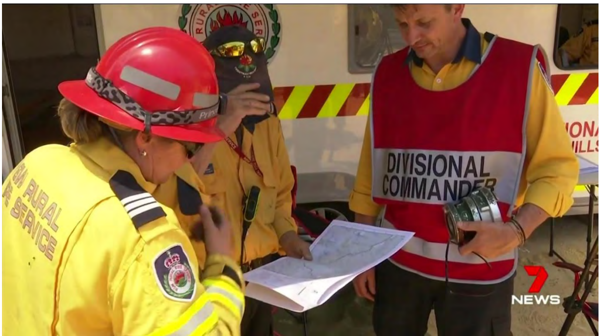
Screen Shot 7 News Sydney (above and all of following page)