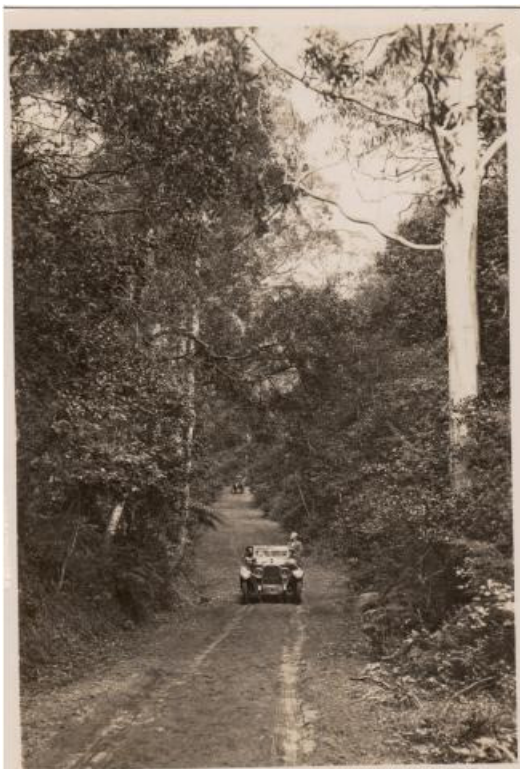
THE ROSE SERIES P. 5242 THE ROAD TO MT. WILSON, BLUE MTS. N.S.W.