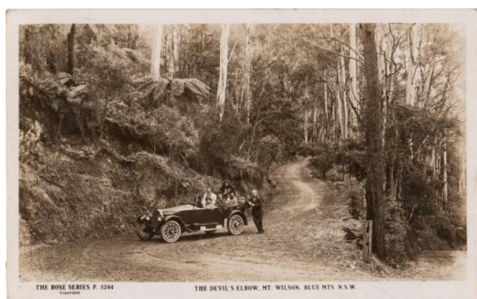
THE ROSE SERIES P. 5244 THE DEVIL'S ELBOW, MT. WILSON, BLUE MTS. N.S.W.

Suggestions, comments or contributions warmly welcomed!