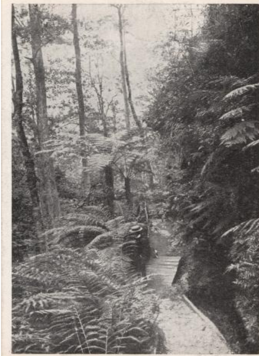
A Typical Mountain Pathway.