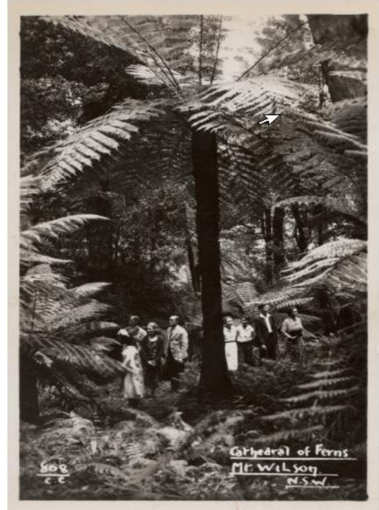
Cathedral of Ferns Mt. Wilson N.S.W.