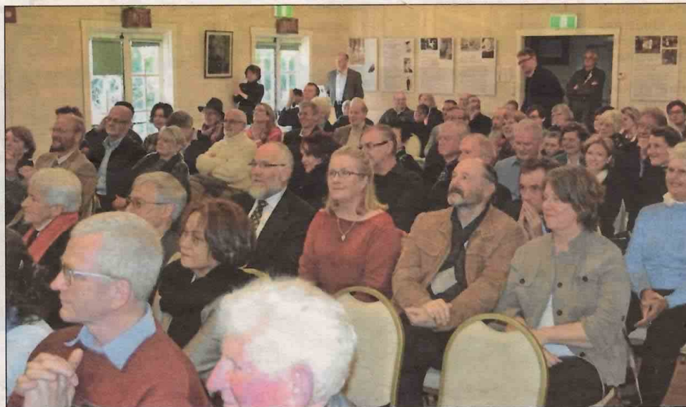
GOVERNOR WAS A POPULAR VISITOR: It was standing room only in the Village Hall for the Governor's visit.

She emphasised how the Blue Mountains environment surely