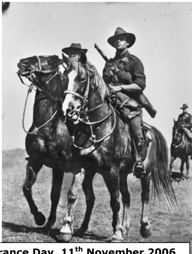
This image of men of the original Light Horse Regiment before departure from Australia comes from the archives of the Australian War Memorial