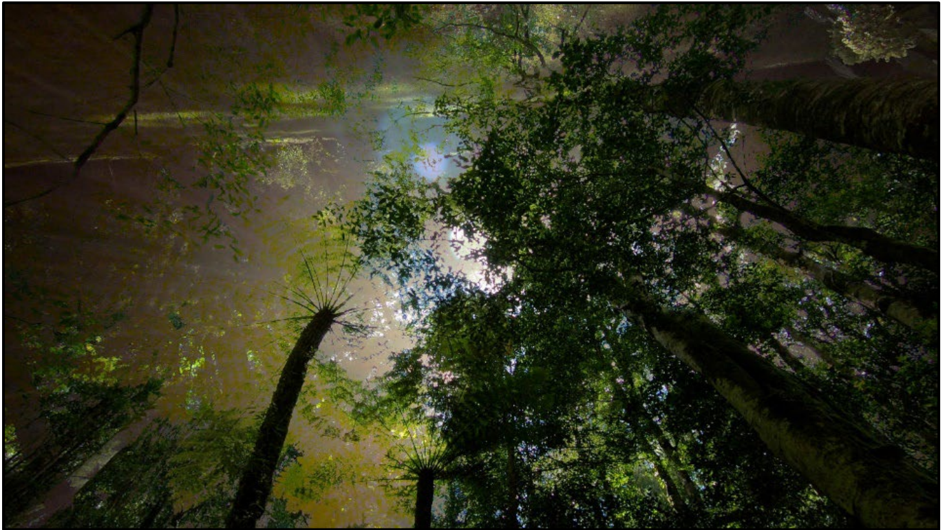
Above: Still image from 'Beauty on Beauty' a finalist in the Lethbridge Landscape Prize 2023.