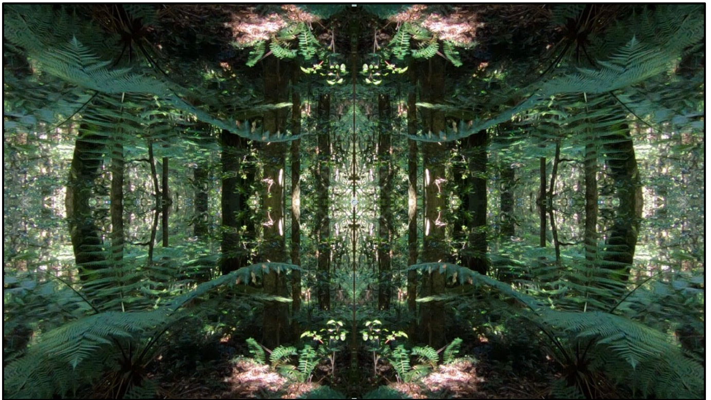
Below: Image of landscape at Lambs Hill