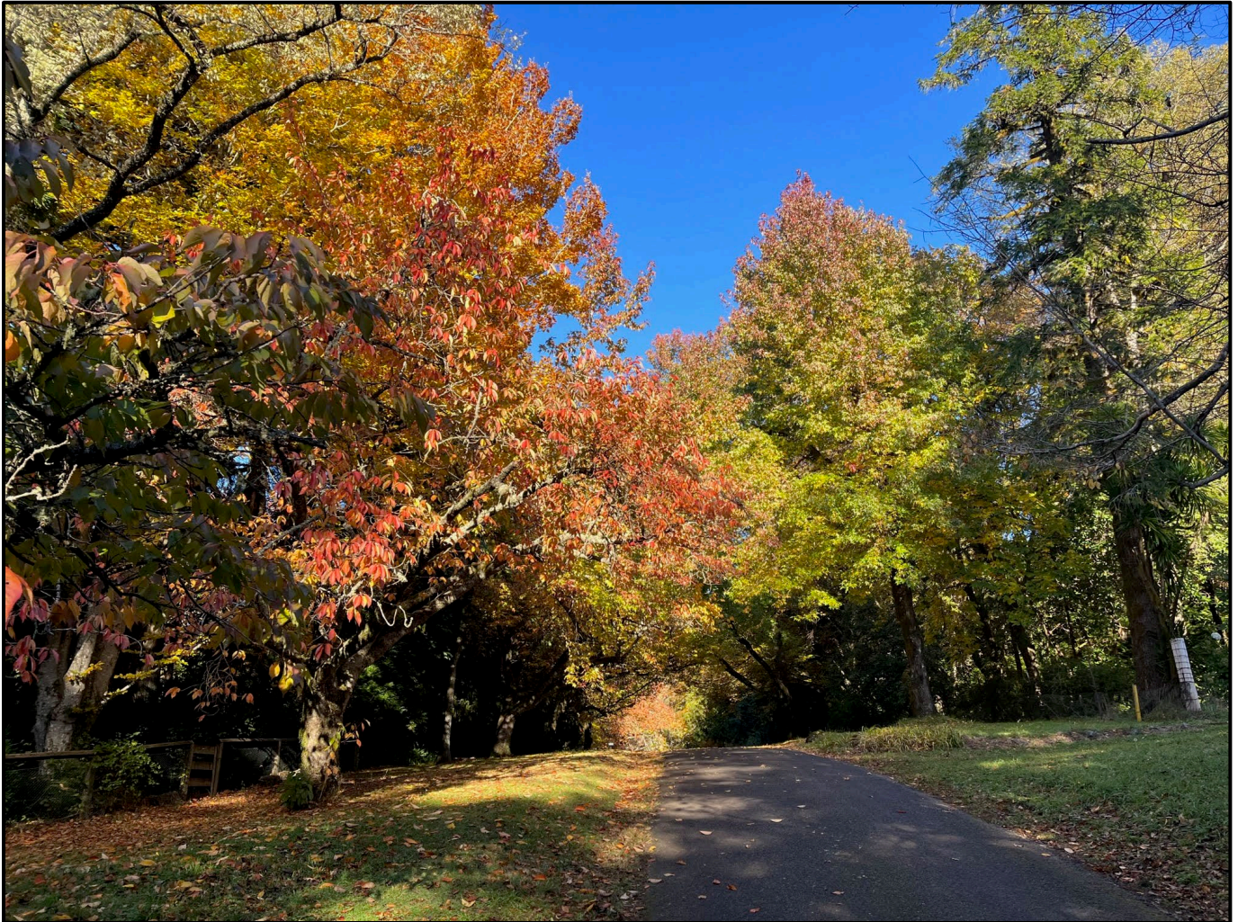
A blast of autumn colour (Sarah Howell)