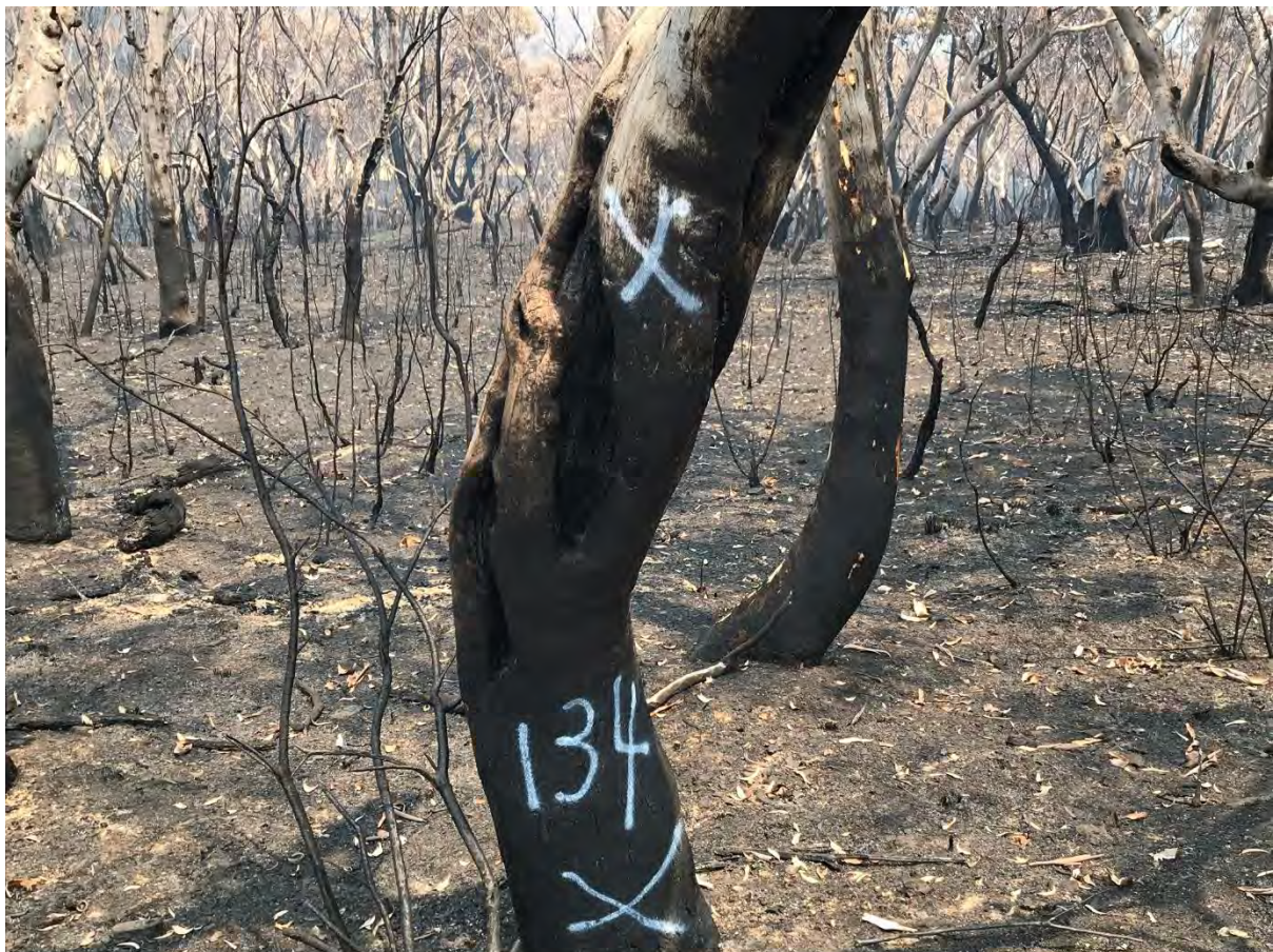
A total of over 250 trees along the five mile were numbered to show those to be removed or substantially pruned, Alex Halliday