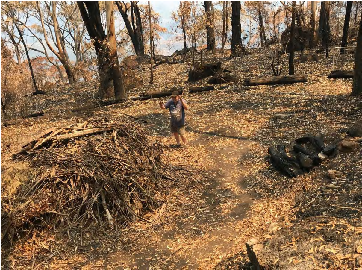
Owen Haviland was not happy that the only thing not burnt was the scrap wood pile, Susie Hope