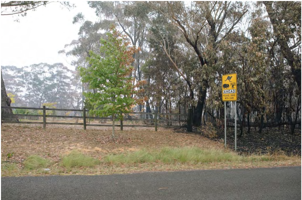
The Old Mill, not the tree is half scorched and half green, Tom Greenwood