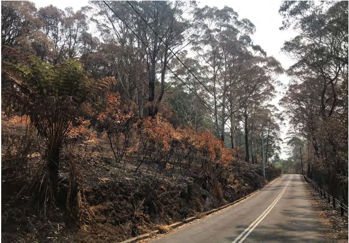
Alex Halliday (this page and following page)