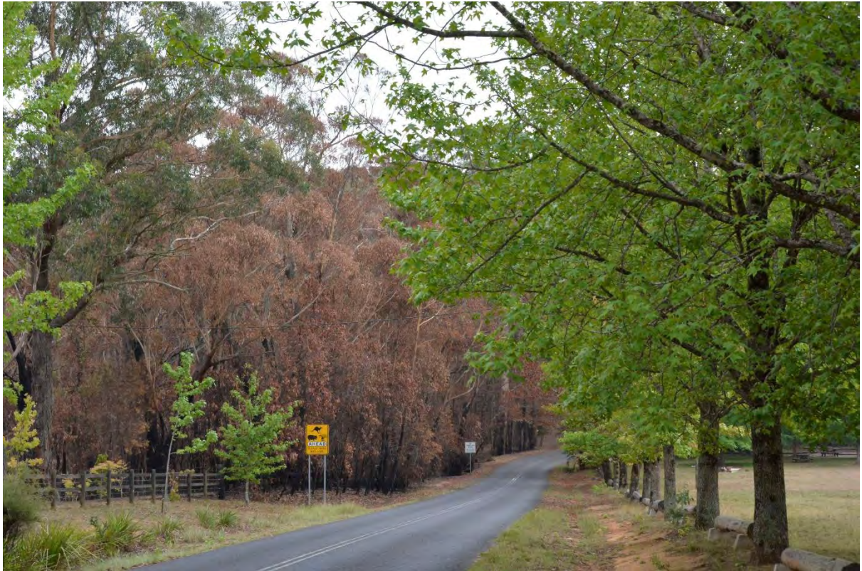
Mt Irvine Road between campground and The Old Mill, Steve Woolfenden