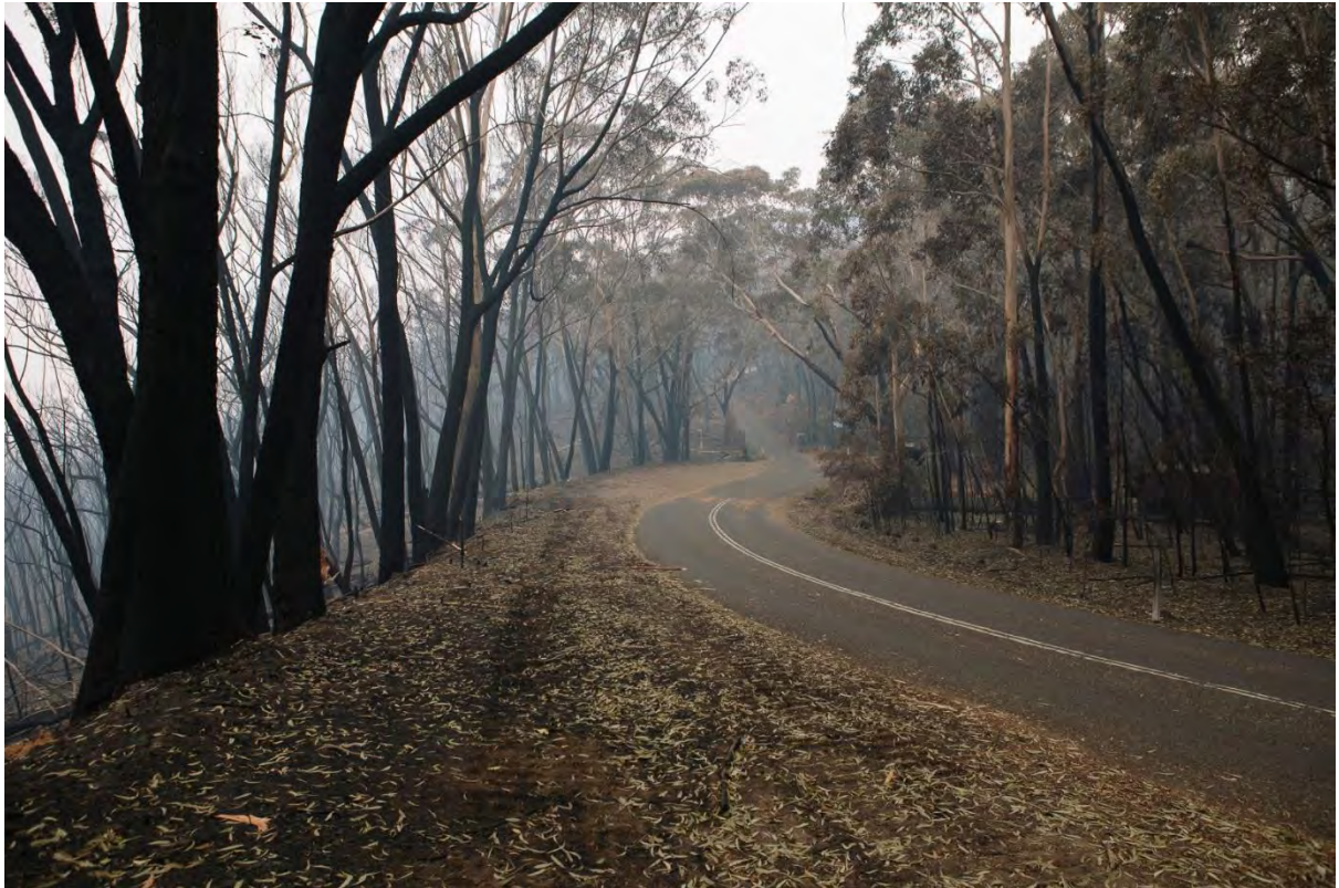
Tom Greenwood (this page and following six pages)