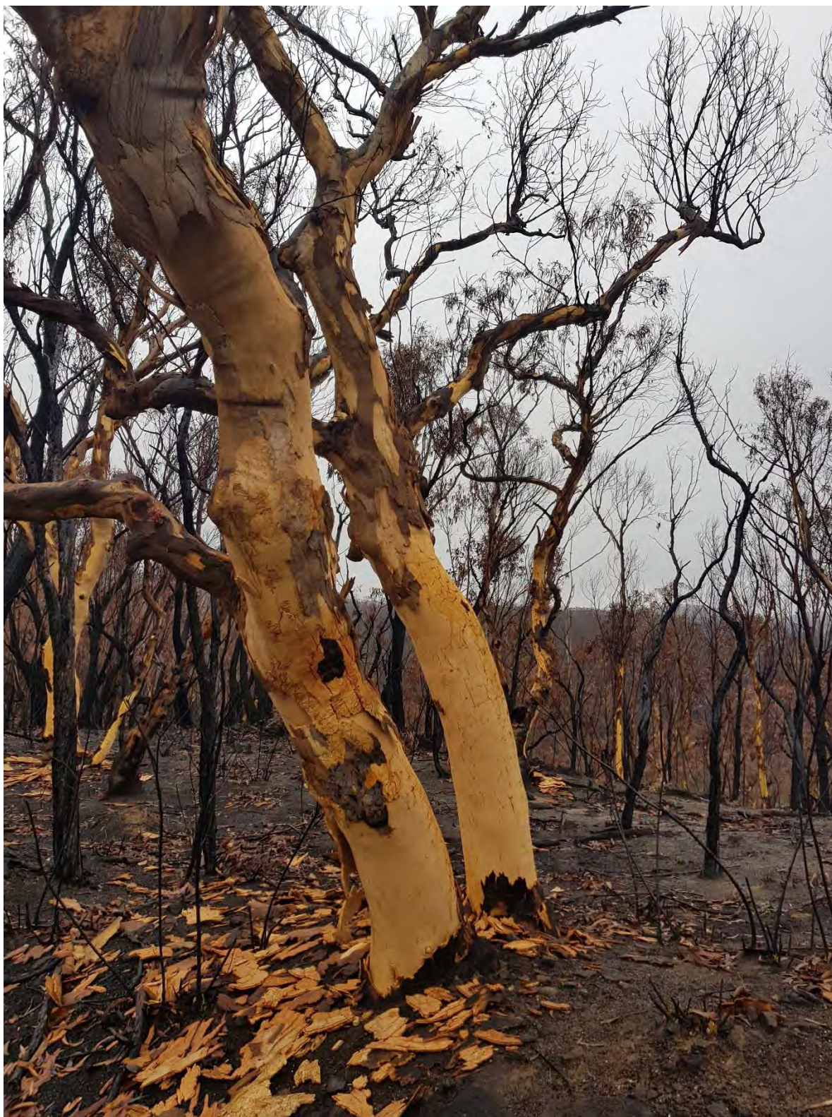
On the five mile, Matilda Halliday