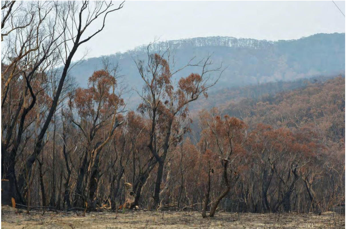
Steve Woolfenden (this page and top of following page)