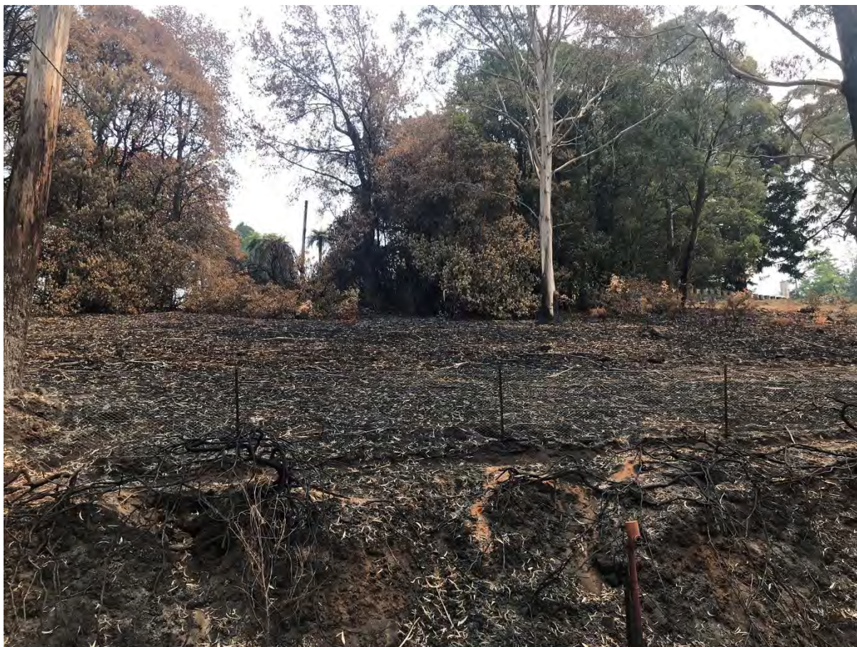
Bottom of Wynstay paddock