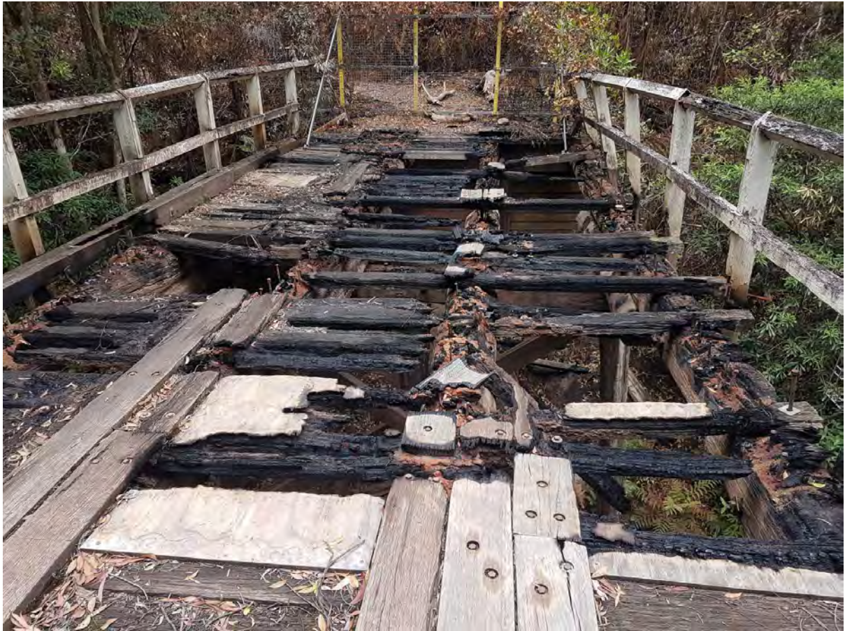
Peter Raines (and following page)