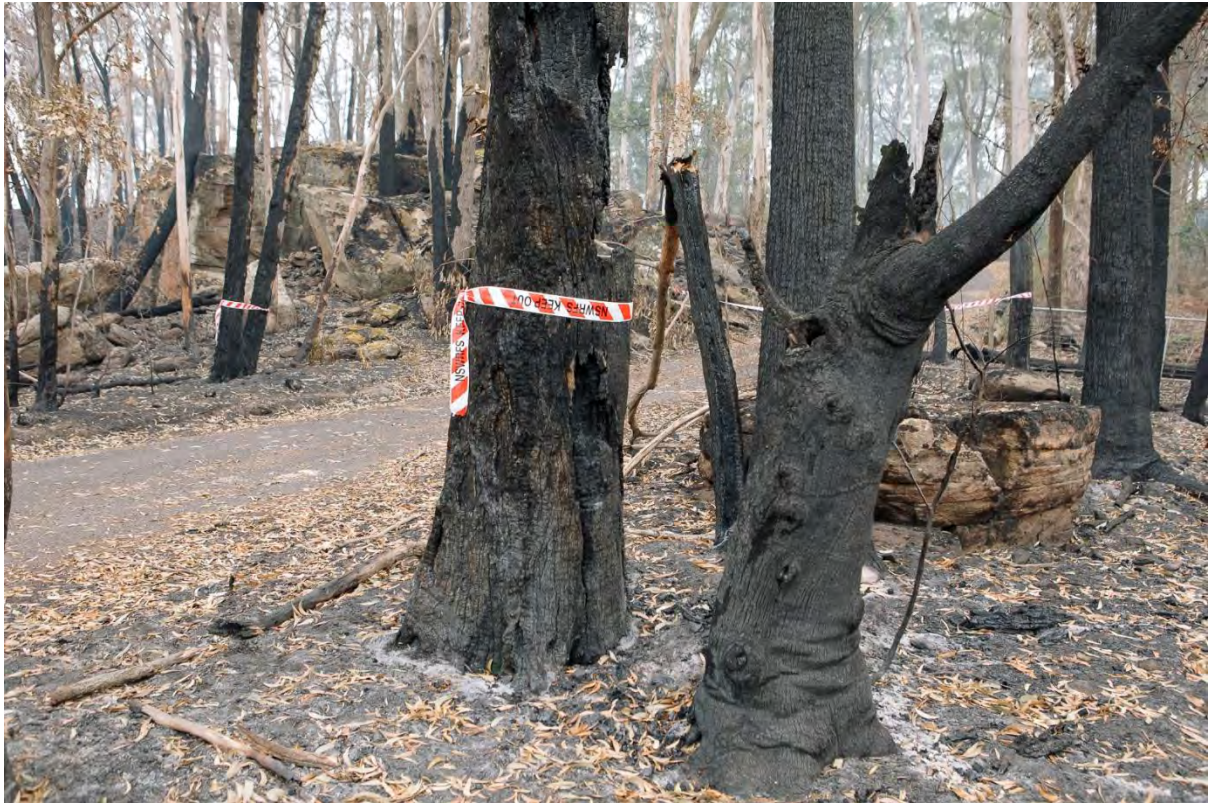
Tom Greenwood (this page and following two pages)