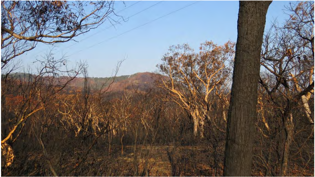
From the five mile, note the burnt and still green sections, Alex Halliday (this page)