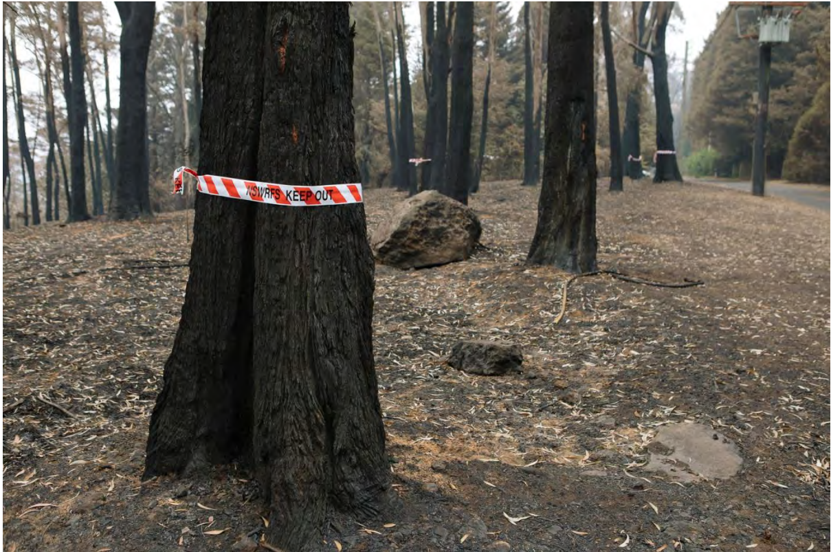
Tom Greenwood (this page and top of following page)