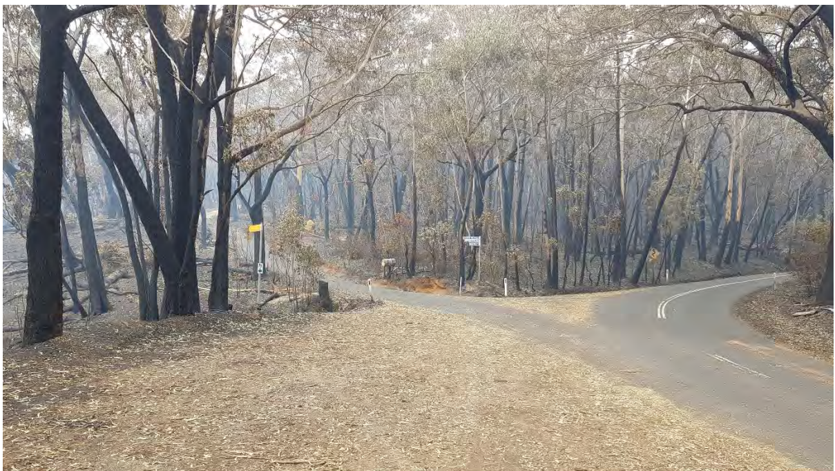
Farrer Road West turn off, see image on page 28 in part one before the fire.