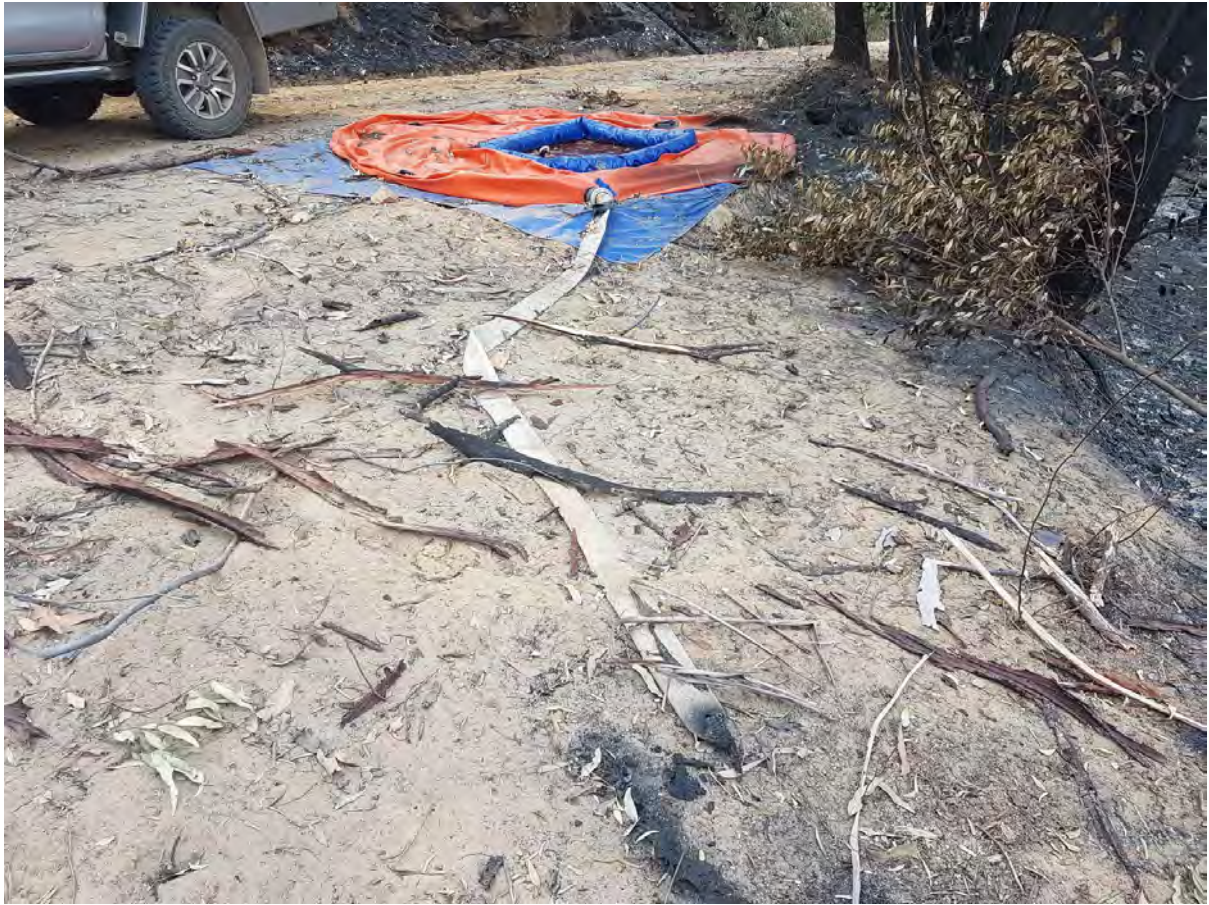
Deflated buoy and burnt hose, see earlier image on page 30 in part one, Peter Raines (this page)