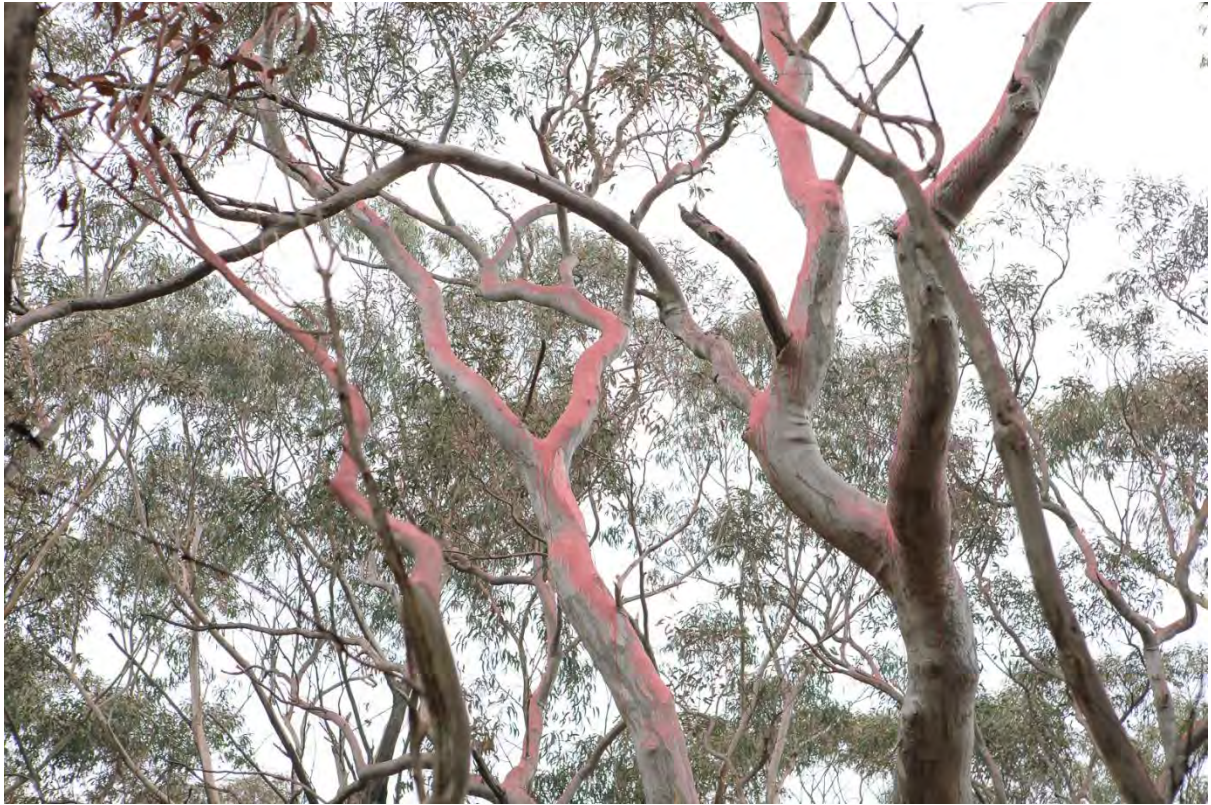
Eucalypt 'painted' pink by retardant