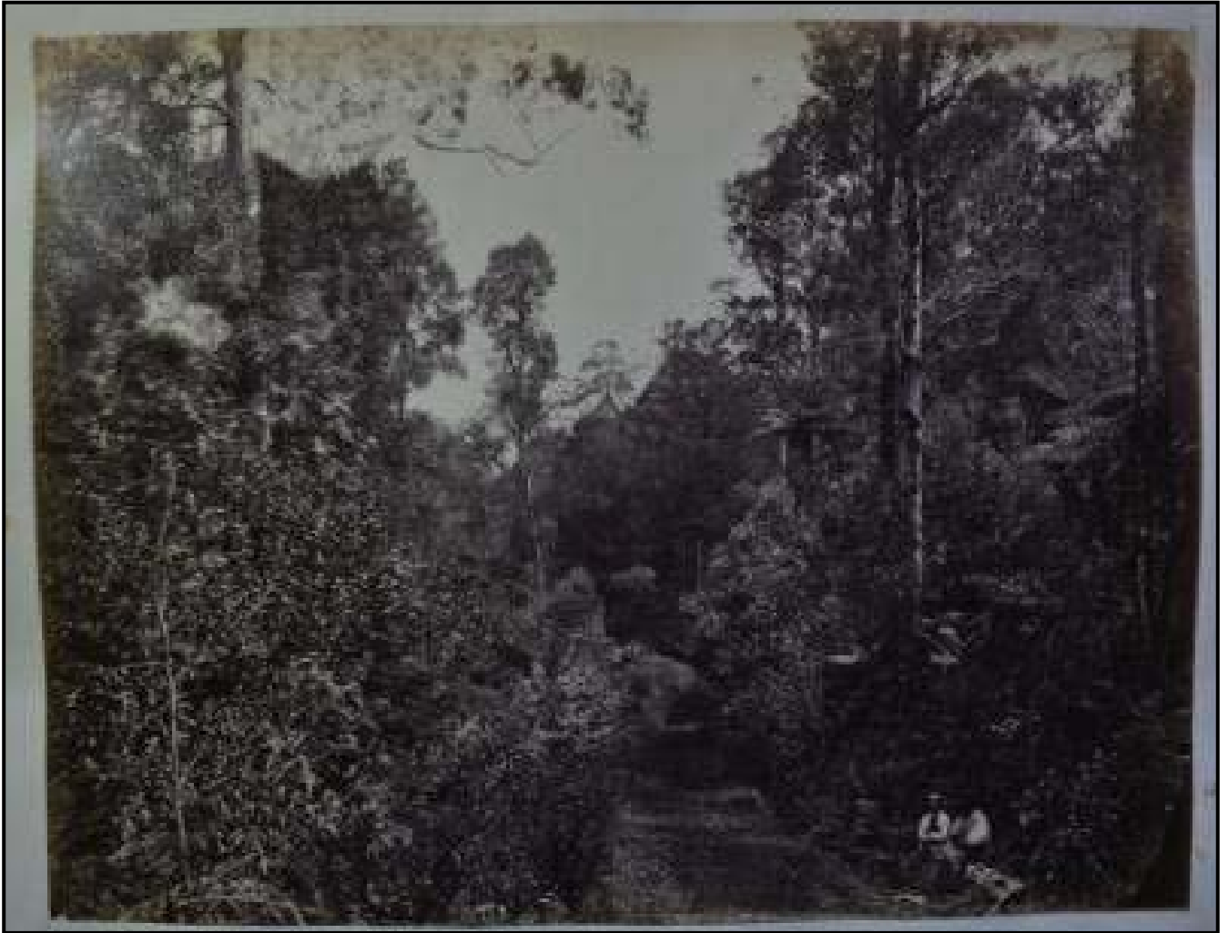
42 — Size 27x35.5cm. A walking track with two men (names unknown) with arms folded and sitting on a log in the lower right-hand corner. The scene also depicts a variety of local flora. Location unknown.