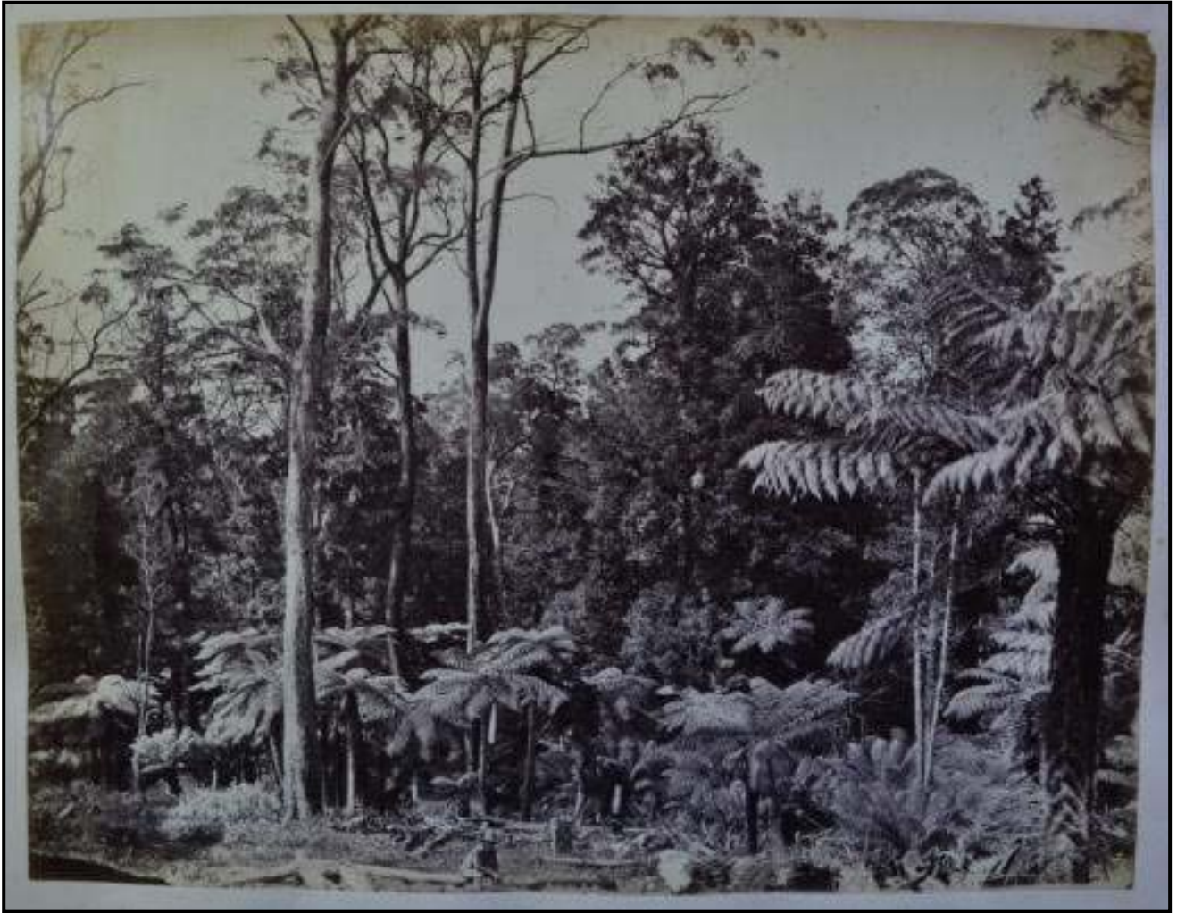
22 – Size 27x35.5 cm. A man (unknown) with a large hat sitting in the foreground surrounded by tree ferns. Location unknown.