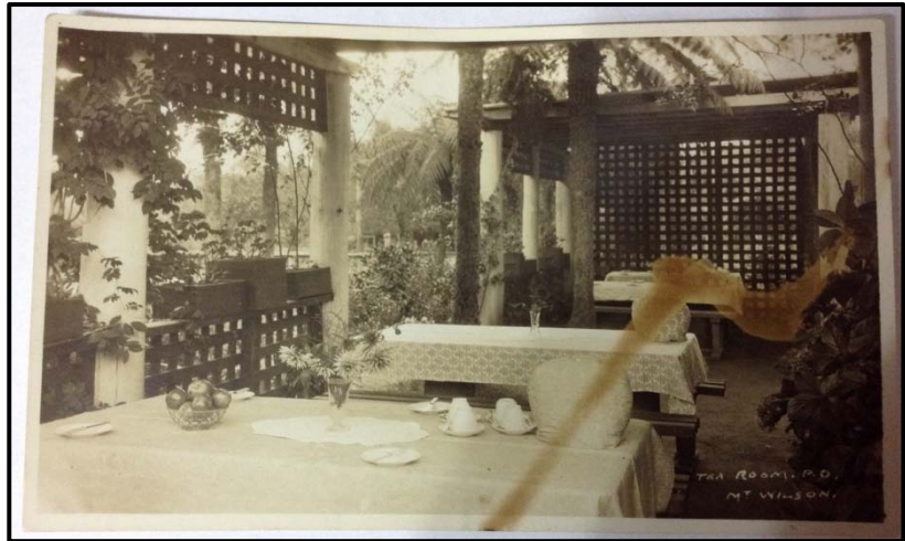
The tea rooms at the Post Office 1920s.