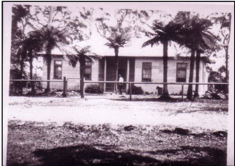
An early photo of the Post House 1922.