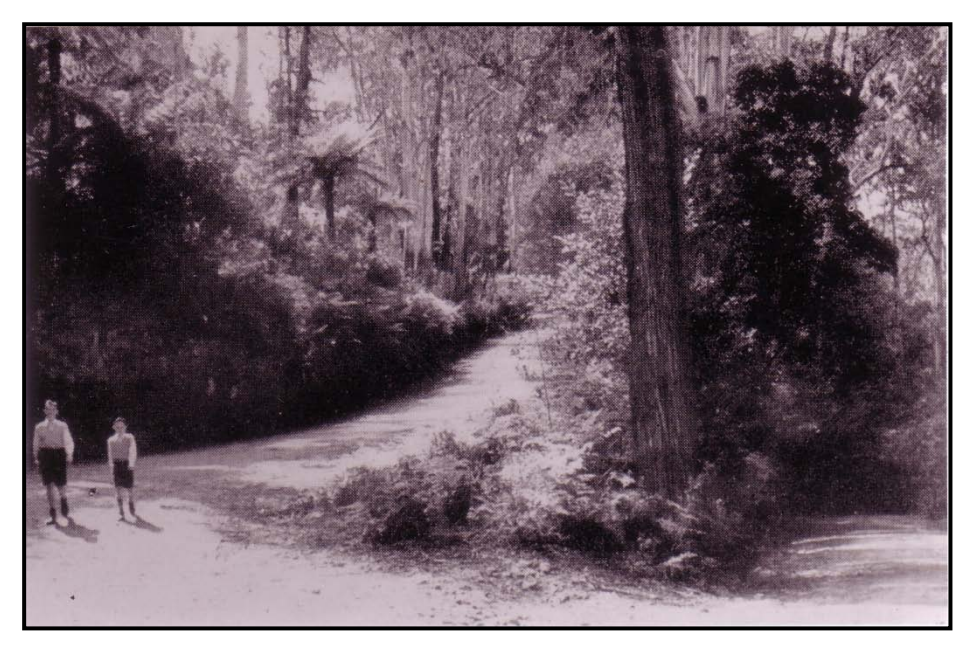
The Zig Zag in the 1930s. Note the distinctive mode of dress for boys in 1930s.

So much for the Local Improvement Rate. Those who have lived in Mt Wilson surely would find the contents of these letters ringing with a familiar theme and in a curious way rather comforting.